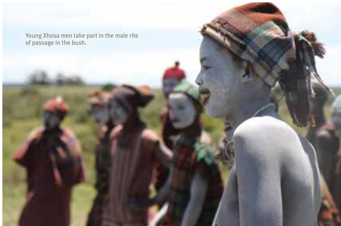
Young Xhosa men take part in the male rite of passage in the bush.

Beyond that, he says, “This trip could inspire these students to rethink what they want to do. It also helped them immensely as journalists—in terms of confidence, experience in tackling a big challenge, stepping up, and doing well. It was a great experience for them to build their skills and confidence level, and I believe they’ll talk about it for years.”